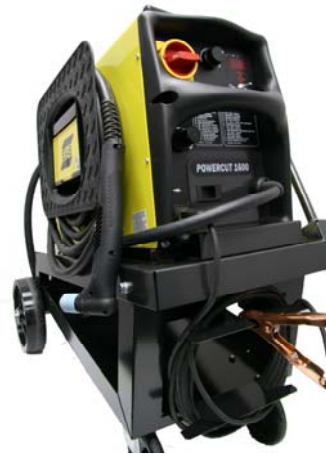
PowerCut™ 1600 package with optional cart